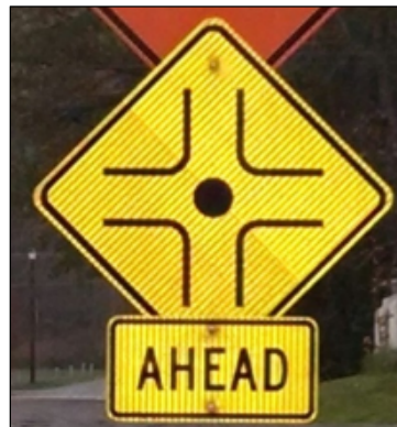
New Traffic Circle Sign

The traffic circle here differs from a roundabout in that the traffic on Dunlop is still controlled by STOP signs. This traffic must stop as before and proceed when conditions are safe to do so.