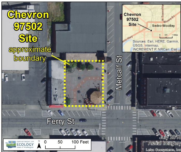
Aerial view of Chevron 97502 Site, July 2018