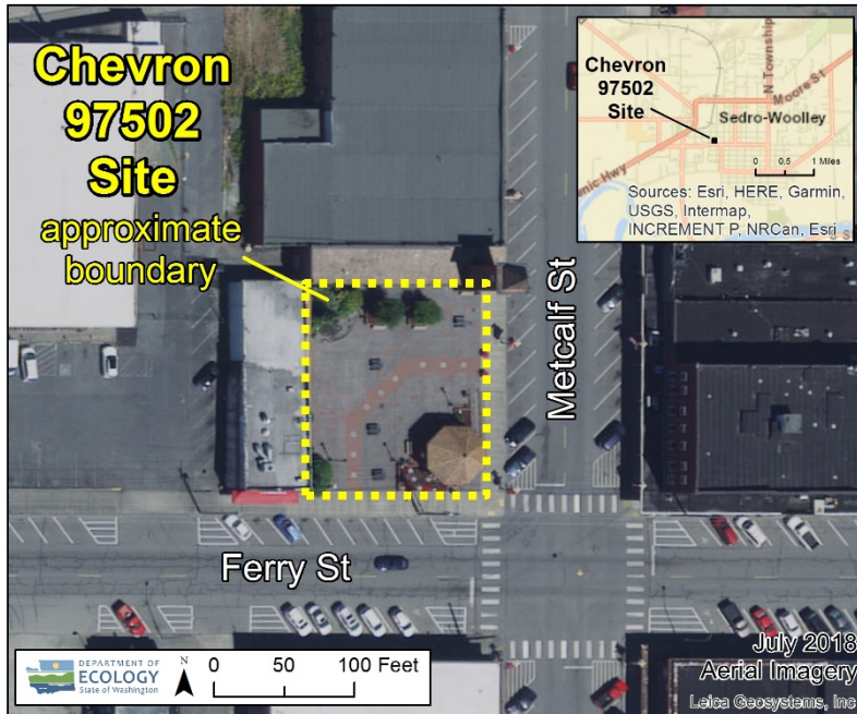
Aerial view of Chevron 97502 Site, July 2018

A gas station operated on the property from 1950 until 1991. Six underground storage tanks and three fuel pump islands were removed between 1991 and 1992 when the gas station was decommissioned.