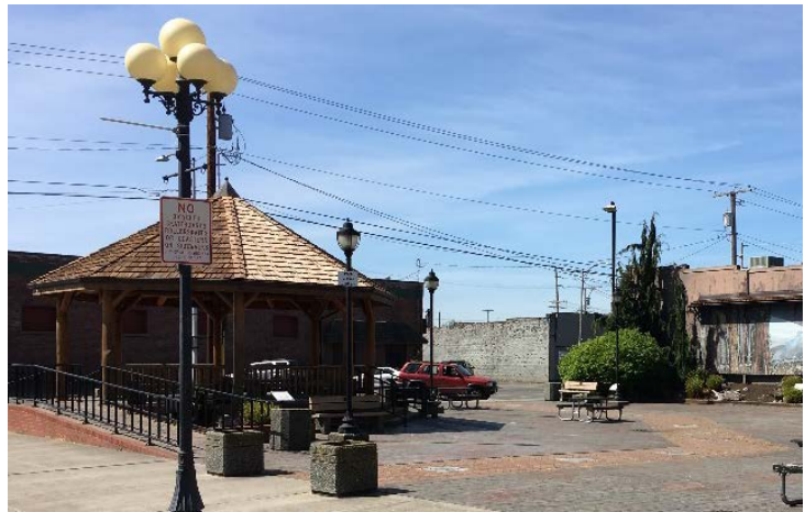
Hammer Heritage Park, May 2019

As a part of the Site’s 1992 underground storage tank decommissioning, approximately 1,800 cubic yards of contaminated soil were removed from the Site. Testing in 2007 found light non-aqueous phase liquid (LNAPL or petroleum products that float on top of groundwater). Approximately 1,500 gallons of contaminated groundwater were removed by vacuum truck. A 2008 soil vapor investigation found soil vapor levels were below MTCA levels of concern. Groundwater was treated in 2009 and approximately 560 gallons of contaminated liquid were removed. Routine groundwater monitoring in 2013-2014 found that contaminated groundwater beneath the Site remains above MTCA cleanup levels established to protect human health and the environment.