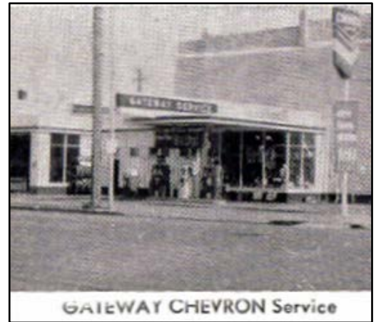
1960s picture of the Sedro-Woolley service station (then referred to as "Gateway Chevron Service") and the location of the current cleanup site.